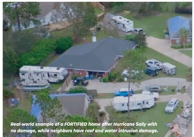
Real-world example of a FORTIFIED home after Hurricane Sally with no damage, while neighbors have roof and water intrusion damage.